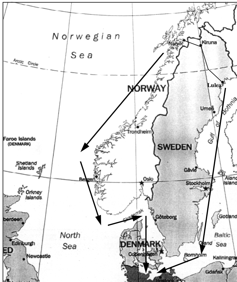
Figure 1. Swedish Iron Ore Routes to Germany

waters at remote points well inside the Arctic Circle and travel under their [Norwegian] protection almost as far as the entrance to the Skagerrak, where the proximity of German air and submarine bases made the rest of the voyage comparatively safe from British interception.” 5 Figure 1 below shows the eastern route from Lulea (ice-bound during winter) and the western route from Narvik through the North Sea to Germany (German ships vulnerable to the British Navy unless in Norwegian territorial waters).